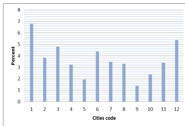
Figure 2. Average content of C18:2 in butter samples of 12 city of west Azerbaijan province, Iran

characteristics and quality matching of traditional butters with Iranian national standard marketed in West Azerbaijan province was the aim of this study. Chemical parameters such as moisture, peroxide value, Iodine value, acidity, saponification value and fatty acids profile and microbial quality of traditional butter samples was determined in this study. According to obtained results, maximum standard limit for moisture in butter is 16% (ISIRI No. 8818, 2006; ISIRI No. 8819, 2006). High moisture content in traditional butters is justified because of the traditional butters preparation method. Since unlike industrial preparation protocol, milk's fat not removes completely and water substitute as a fat replacer in butter formulation (Saremnezhad et al. , 2008; Idoui et al. , 2013). High moisture predispose lipase activity, stimulates the growth of microorganisms and hydrolysis of the triglycerides (Idoui et al. , 2013).